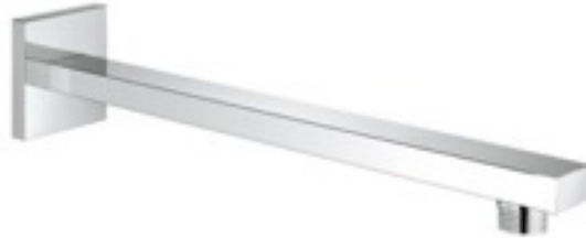
CAPTION: The Grohe Rainshower shower arm is water efficient and retails for R995.00 from Bathroom Bizarre ( www.bathroom.co.za ).