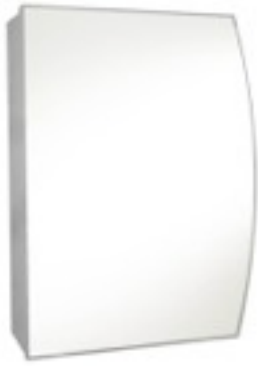
CAPTION (LEFT): The Eclipse wall mirror unit retails for R795.00 from Bathroom Bizarre ( www.bathroom.co.za ).