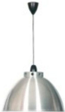
CAPTION: The Saturn Aluminium pendant light retails for R550.00 from Bathroom Bizarre ( www.bathroom.co.za ).

Many bathrooms tend to have little natural light, yet it's the one room that gets used several times throughout the day and night. Thus it is important to get your bathroom lighting sorted, starting with a central pendant to flood the room with light. "Not only does a ceiling pendant provide general light that's so necessary in this functional space, but it also creates a focal point that anchors the room visually," explains Jasmin, pointing out Bathroom Bizarre's Saturn aluminium pendant retails for a mere R550, yet manages to elevate the bathroom look into something special. She advises getting a certified electrician to install the light fitting in your bathroom to ensure it meets all the necessary safety standards.