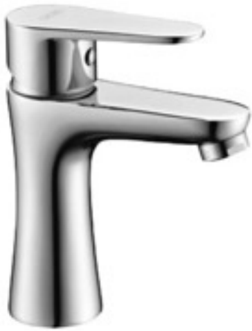
CAPTION: The Serenity basin mixer retails for R795.00 from Bathroom Bizarre ( www.bathroom.co.za ).