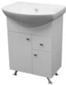
CAPTION (RIGHT): The Casso Alegre 571 floor unit in high gloss white, fitted with the Porto Alegre 645 ceramic basin, retails for R2 390.00 for the set from Bathroom Bizarre ( www.bathroom.co.za ).