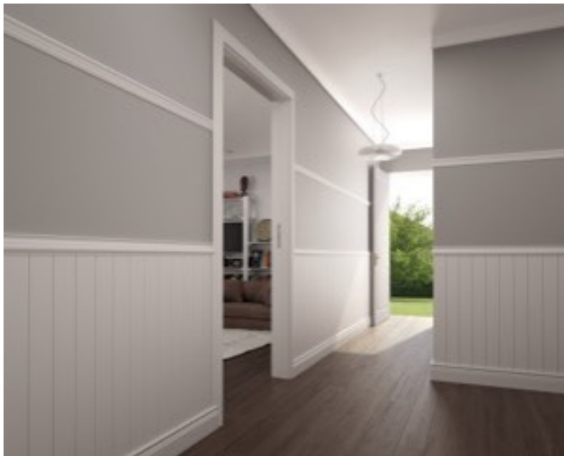
CAPTION: The installation of picture rails, architraves, dado rails, wall paneling and skirting boards have turned this entrance hall into a welcoming and elegant interior space.