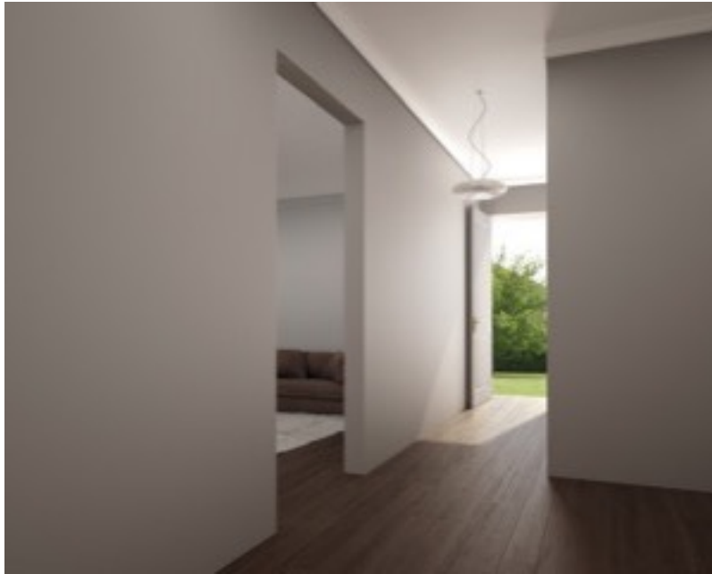
CAPTION: Before decorative mouldings were installed, this entrance hall lacked character and definition.